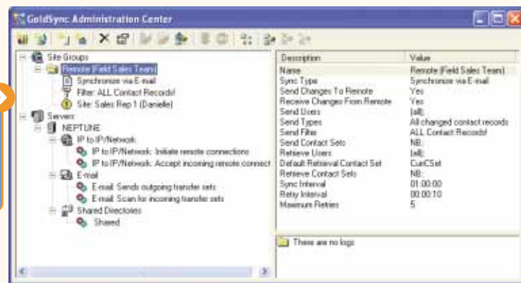
The GoldSync Administration Center allows you to assign properties to individuals and users, so you control who gets what information.